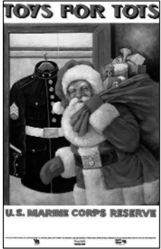
Official poster of Toys for Tots

Every year, all across the country from small towns to big cities, Toys for Tots drop boxes are ubiquitous. Civic and religious organizations, businesses like retail stores and restaurants, corporations, banks, television and radio stations, and even hospitals, have partnered with the U.S. Marines and toy manufacturers to give toys at holiday time