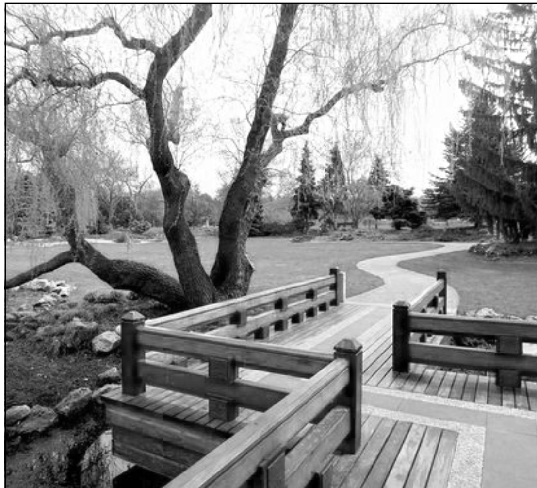
Bridge in the Lyndale Peace Park, Minneapolis, incorporates inlaid Minnesota granite and relic stones from the 1945 U.S. bombing of Hiroshima and Nagasaki.

But true to form, the U.S. government takes a positive attitude toward the proposal of remilitarizing its ally Japan. Meanwhile, the threat of China has been cited by Japanese officials as a reason to modify the constitution.