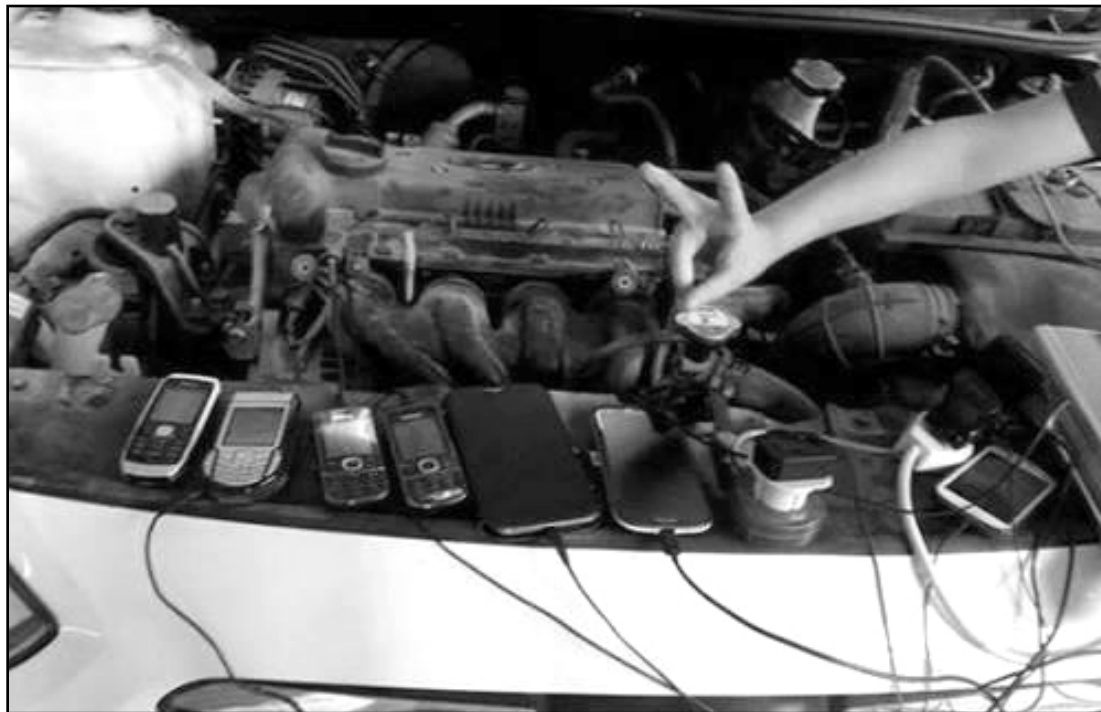
Above: Necessity is the mother of invention. Gazans “jump-start” their phones from a motor vehicle battery during the war. Israel destroyed its only power plant. (Via @drsaeedkanafany)

Sent during the July and August 2014 Israeli bombardment. Individual tweeters self-identify in their descriptions.