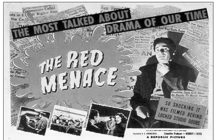
Red Scare vintage film poster

Hoover was a part of the anticommunist propaganda culture America was steeped in during the decades of the '40s, '50s and into the '60s. The planting of anticommunism in the minds of the American people was deliberate. Psychological warfare was part of the World War II effort and continued to be a major weapon during the years of the Cold War, practiced by the U.S. not only around the world but domestically as well. 6