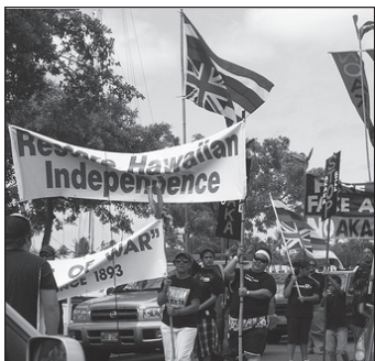
Independence movements continue to exist in Hawaii and include protests against environmental and cultural degradation and occupation by the U.S. military.

—Philippine Congressman Neri Colmenares of Bayan Muna Party at the U.S. Hands Off Subic Bay Press Conference and White House Action, in front of the White House, 1600 Pennsylvania Avenue NW, July 20, 2015