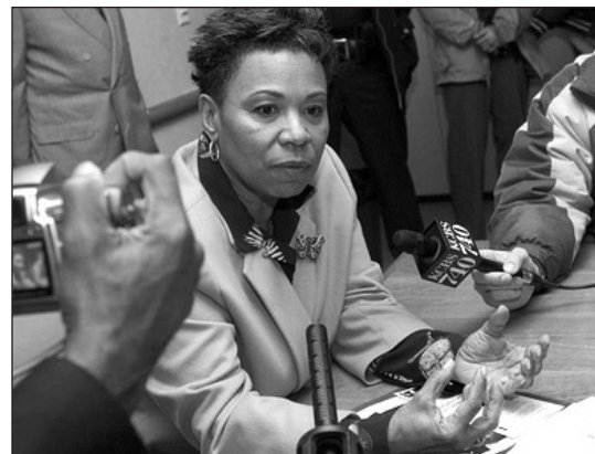
U.S. Congresswoman Barbara Lee

Nevertheless, Barbara Lee has continued to be a voice representing her antiwar-prone constituency, the East Bay area of northern California, and to argue against bombing and military “solutions.” She has advocated long and hard for ending America's state of perpetual war and for reining in the military-industrial complex, and she has had the courage to vote against her own political party on these issues. In 1999, Lee voted against authorizing air strikes in Yugoslavia and in favor of a plan to completely withdraw U.S. troops. She was the only member of