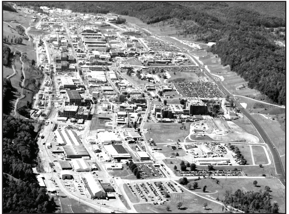
Above: The Y-12 National Security Complex, whose website describes itself as “the ‘Fort Knox’ of uranium”, was compromised by an 82-year-old nun.

Congressional hearings were called in regard to the break-in. Investigations of the Oak Ridge Y-12 National Security Facility proved that security was extremely faulty at the site. Security cameras did not work and communication between the two companies who provided security was poor. However, the intent of the Ploughshares Transform Now activists