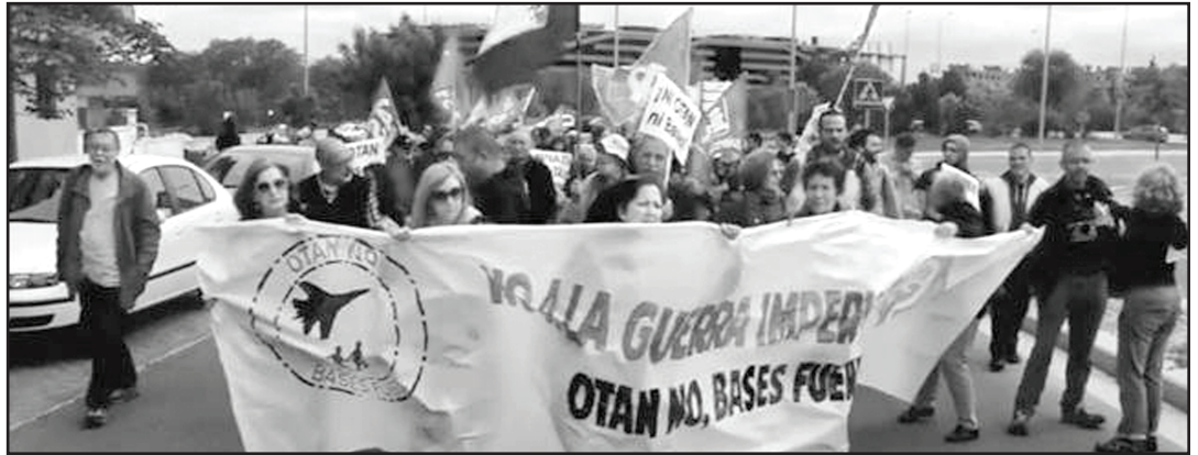
Spanish protesters rally against NATO and the bloc's bases in the country during a march from Madrid to the Torrejón Air Base on April 25, 2015.

It's evident that Europe is being used as a staging ground for threatening other regions. As European citizens protest U.S.-led NATO militarism, U.S. citizens can heed what they say and demand that our government stop intruding on their land with our military bases and machinery of war in what looks like a buildup to WWII. Referred to bitterly as "the Atlanticists," in other parts of the world, NATO nations have moved far from their supposed origins as organizing for defense. NATO has split apart Yugoslavia, bombed Libya relentlessly, instigated a literal tug of war over Ukraine with its partners, and is encircling Russia. It continues to incorporate compliant nations and divide the world into Allies and Others. Like their European counterparts, people in the U.S. can call out NATO's role in military madness.