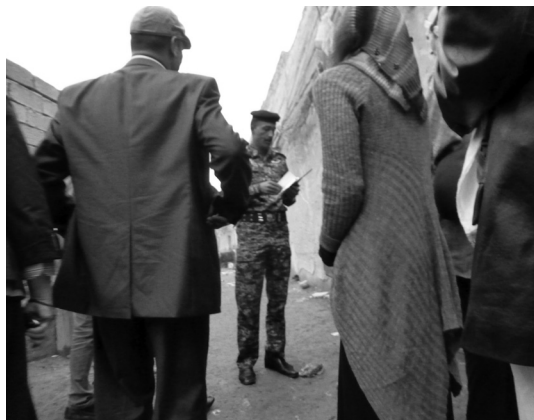
Visitors stopped at checkpoint attempting to visit the tomb of the Prophet Ezekeil.