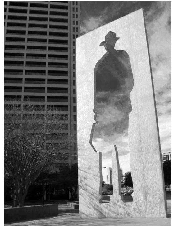
Right, Man with Briefcase. 50 ft. aluminum-plated sculpture by Jonathan Borofsky, Ft. Worth, Texas