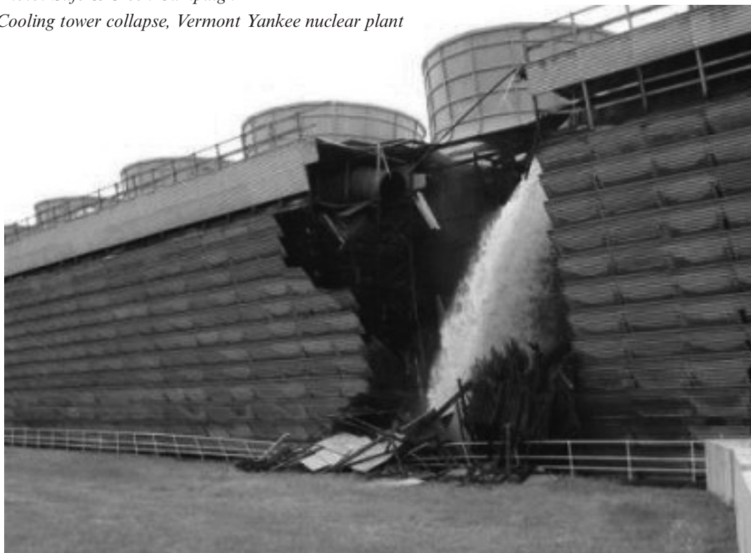
Cooling tower collapse, Vermont Yankee nuclear plant