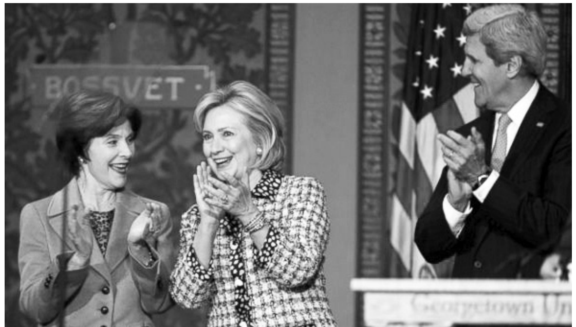
Laura Bush and Hilary Clinton, with current Secretary of State John Kerry, receiving an award in Washington for their work with women in Afghanistan and around the world.