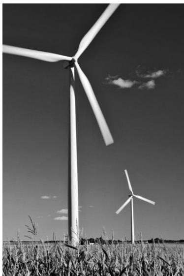
The answer blown in the wind: turbines at Buffalo Ridge, Minnesota

With its serious fracking issues, natural gas