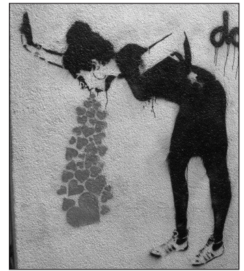
Wall art by Domke, Germany