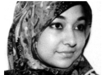
Aafia Siddiqui, the hopeful young woman, as she is remembered in Pakistan.