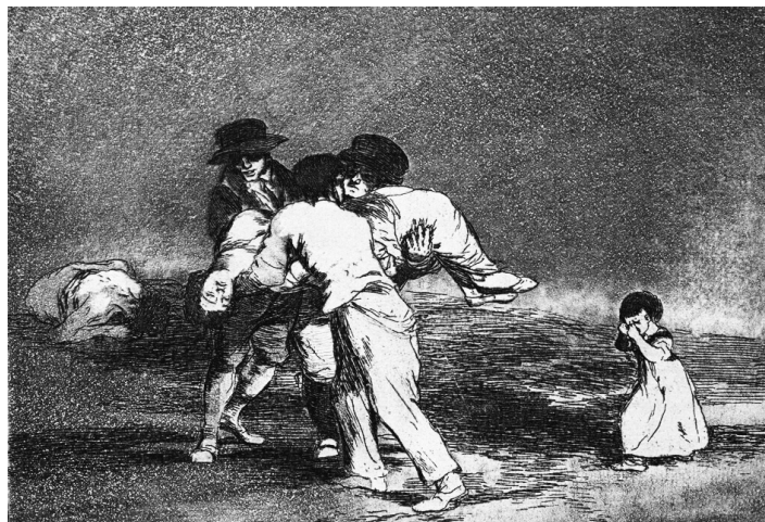
La Madre Infeliz! (The Unhappy mother!) from the series, Los Desastres de la Guerra (“The Disasters of War”). Etching by Francisco Goya, 1863