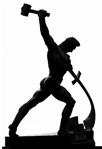
Let Us Beat Swords into Plowshares by Russian sculptor Evgeniy Vuchetich, United Nations Art Collection

To begin with — an immediate 50 percent reduction in the military budget followed by an annual 10 percent reduction until the military budget equals the average of European nations' budgets. The Minnesota Arms Spending Alternative (mnasap.org) has been actively working on resolutions to shift federal spending priorities in this direction. The National Priorities Project (nationalpriorities.org) is a good resource for information.