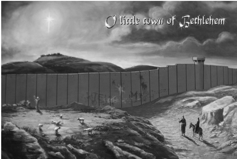
No Hallmark Greeting: Travelers are arrested by the 30-ft. high Segregation Wall and watchtower. Banksy image. Cards with image: ifamericansknew.org

The logic of military and political power dictates that Israel is now building more Jewish settlements and demolishing more Palestinian homes and farms in spite of its obligations under signed agreements and under international law. The Obama administration and Congress (beholden to the pro-Zionist lobby) stand isolated among the community of nations in their support of this apartheid regime.