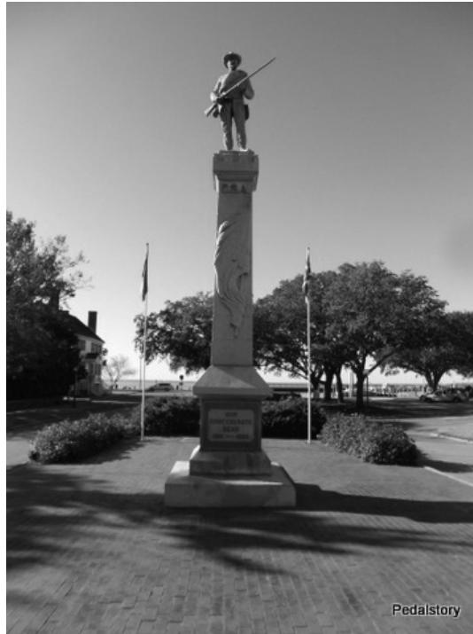
Statue of "The Unknown Confederate Soldier," flanked by Confederate and U.S. flags, Edenton, North Carolina

about Marines constructing hospitals and schools in Latin America, an MRI machine on its way to Helmand Province, and the local soccer game between Marines and Jacksonville teens. But the sounds of bombs bursting in air as we rode out of town, and a flashing sign: " WARNING Military exercise when lights are flashing: Watch for thick smoke, low visibility on freeway " reminded us of the real purpose of this base.