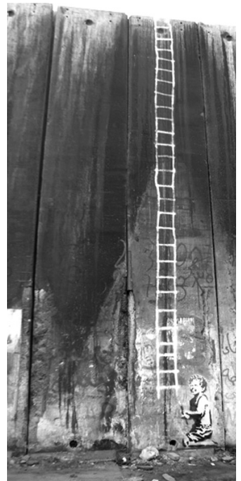
From the Palestine Wall Project of UK graffiti artist Banksy

Women Against Military Madness: Middle East Committee (Click on Middle East Committee at bottom of worldwidewamm.org site.) provides a more extensive list of resources to take you over the wall beyond the silence, disinformation and misinformation on Palestine. The following are just a few from the list of the resources you will also find there: