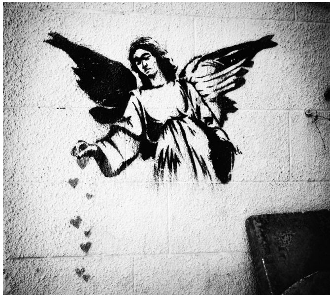
An angel stencil in Bethlehem by London-based, wall-graffiti artist Banksy who made images on buildings and the Segregation Wall in Palestine.