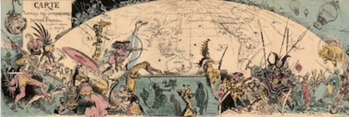
Carte des Voyages Tres Extraordinaires de Saturnin Farandou, (Paris, 1879) spoof of Jules Verne's Voyages Extraordinaires by Albert Robida, considered the father of science-fiction illustration

That is what worries U.S. hegemonists, who want U.S. to act as the single dominant power in a New World Order, crossing nation-state boundaries freely in the service of transnational corporations to mine the world for profit. 9 A multi-polar power-sharing dynamic throws a wrench in the U.S.'s own Silk Road plans that had long been in the works. The U.S. Congress adopted the Silk Road Strategy Act on March 19, 1999. Grabbing control of former Soviet space and NATO expansion were key to the economic and strategic schemes. 10