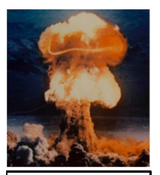
Senator Amy Klobuchar 1200 Washington Ave. S. Minneapolis, MN 55415