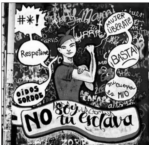
Latina Rosie the Riveter mural