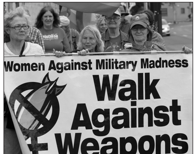
WAMM Annual Walk Against Weapons.

Don't despair! Do something! There is no denying that powerful forces are causing enormous harm in the world. Action is the best anecdote. Join the peace movement and show how powerful we are together.