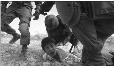
Palestinian home demolitions and brutal, often arbitrary, arrests including of children, are systemic under Israeli occupation.

American states to pass legislation against the boycott of Israel.” 2