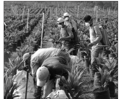
The Palm oil industry exploits workers and causes deforestation.

For a century the U.S. dominated the export economies of Latin America. It was the majority buyer and seller to the region, taking the place of Britain and Spain as the dominant power in the region. The U.S. would