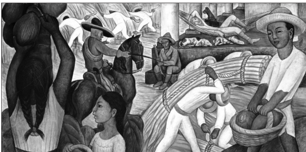
Ownership of labor, land, and resources has been an ongoing struggle in Latin America. Mural, Diego Rivera, 1931.

In the 21st century however, the U.S. is no longer the economic king in the region. China, Canada, Japan and the E.U. are investing heavily in the region. China's interests are growing especially fast, and they have become the dominant power in some nations, such as Nicaragua. Regional powers like