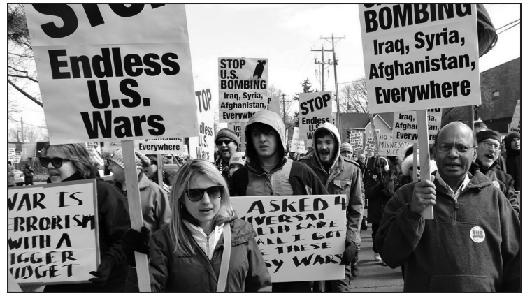
March 18 Minnesota Peace Action rally, Minneapolis. The American people do not want war waged in their names and with their tax dollars.

Before the federal budget for any given period passes, congressional committees need to examine the various areas in the budget and make their own recommendations. House and Senate Armed Services Committees are responsible for funding and oversight of the Department of Defense which includes all branches of