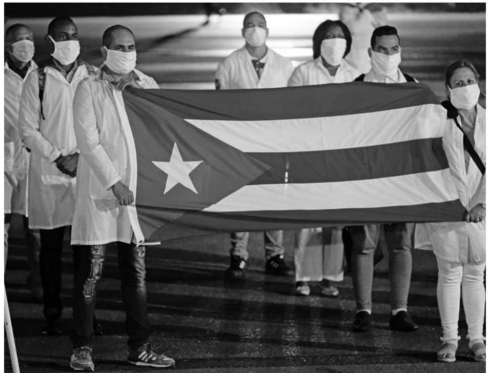
Cuban medical team arrives in South Africa.