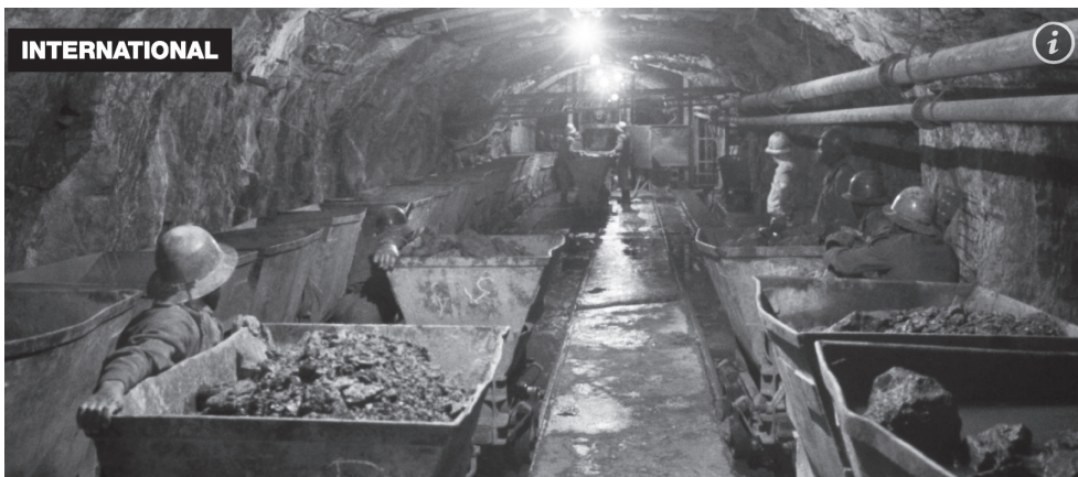
Shinkolobwe mine, the origin of uranium used in the Manhattan Project to build the bomb dropped on Hiroshima. Congolese workers were not informed that they were dealing with radioactive material.

The legacy of the Shinkolobwe Mine is felt all over the world from DRC communities to those living near nuclear dumps across the U.S. to downwinders from the first test in New Mexico and U.S. weapons dropped on Japan. There is a common thread among these people: a desire for recognition and justice for what was suffered as a result of the U.S. government program to build an atomic bomb.