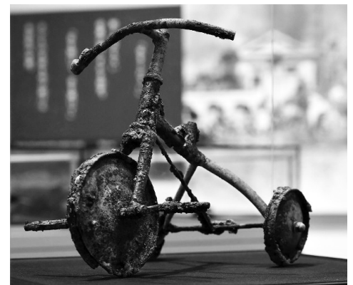
Child’s incinerated tricycle. Photo: The Hiroshima Peace Memorial Museum.