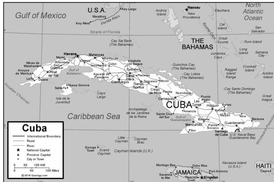
So close and yet so far away: 106 miles from Havana to Key West, Florida as the crow flies, and a one-hour flight from Miami to Havana.