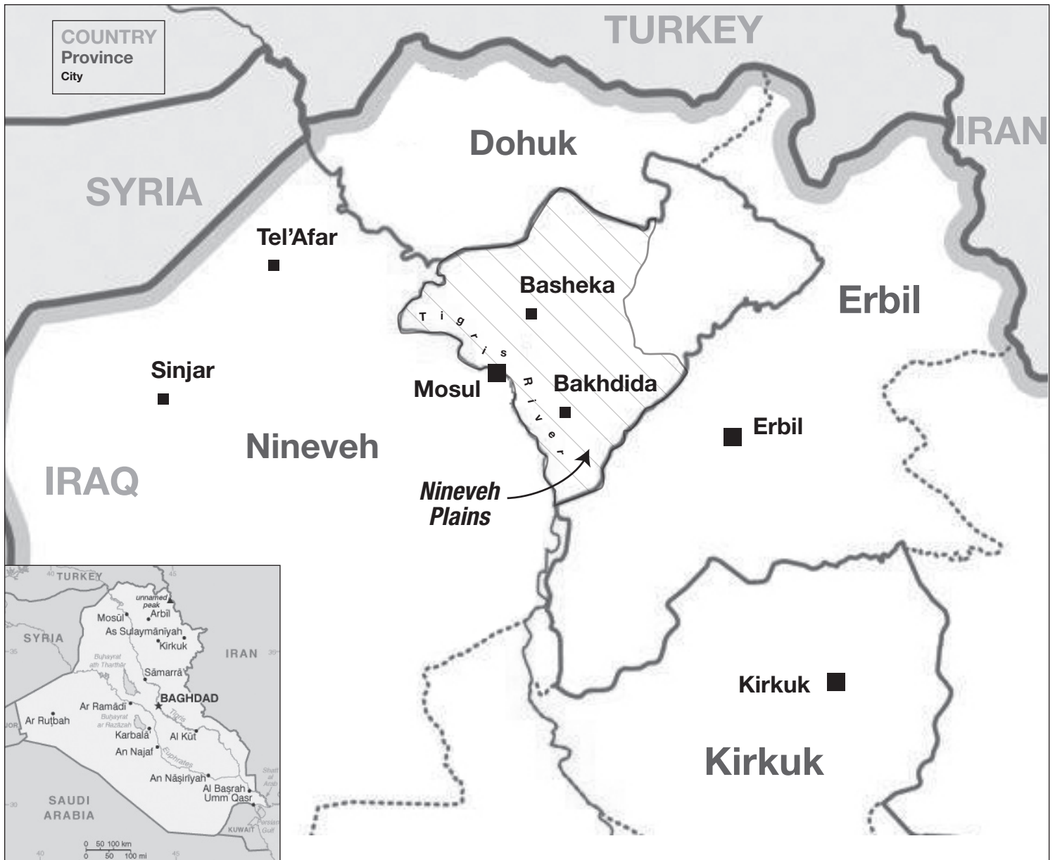
The Mosul area and areas to the east in Iraq's Nineveh Plains some of the seven women mention, as well as Erbil (also spelled "Arbil") and Kirkuk where they moved. In late July, U.S. coalition forces with regional militia pursued ISIS to the west and again civilians suffered.

culture destroyed, of people massacred by creatures—so-called humans. Our life ended three years ago when we were forced to leave our hometown on the sixth of August [2014]. It was a miserable night. The church bells commenced ringing in an alarming way, declaring full evacuation of the area as a notorious militant group called ISIS continued heavy shelling and was making major advances into the area. Everyone, including my family and me,