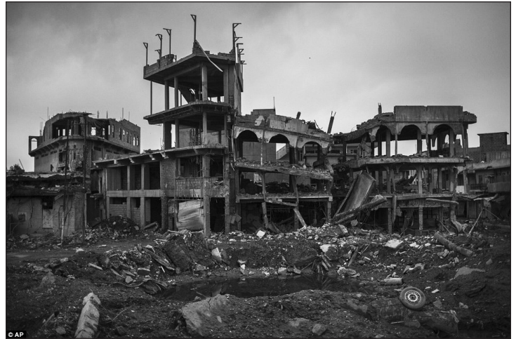
Mosul in ruins.

Sandra Salim Elias is a 25-year-old lawyer from Basheka, twenty kilometers (approximately twelve