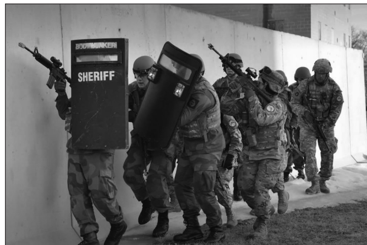
County sheriffs practice training in military methods at Camp Ripley, Minnesota.