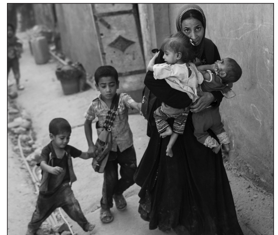
The liberation of Mosul: civilians were trapped while the city was being destroyed.

Thank you to everyone for making the 35th anniversary of WAMM a success!