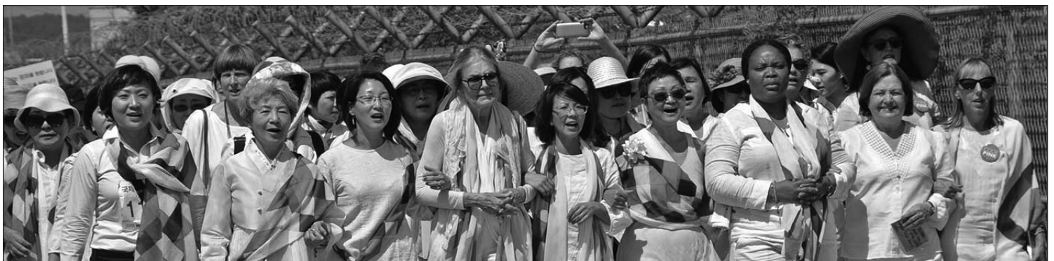
An international delegation, along with women from North and South Korea, walked together along the DMZ (DeMilitarized Zone) in 2015, advocating for an end to the Korean War and reunification on the 70th anniversary of the division of the Korean peninsula.

*North and South Korea, the U.S., China, Japan, and Russia came together in efforts to reach an agreement on the dismantling of North Korea's nuclear weapon program in 2003 to 2009. ☺