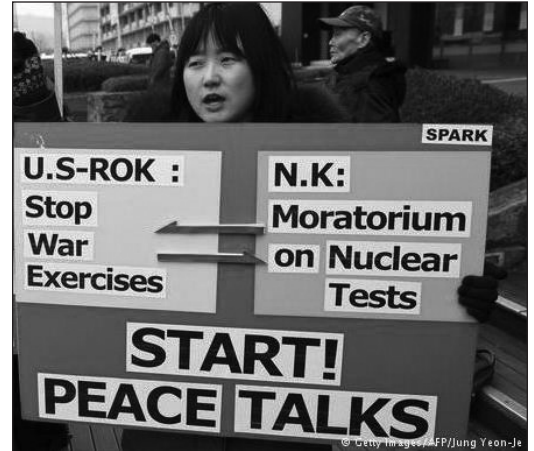
A South Korean activist shows how to start peace talks between North Korea (DPRK) and U.S./South Korea.