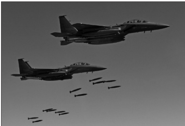
The South Korean Air Force dropped live bombs on its military firing range in the northern province of Gangwan-Do on August 29, "simulating the destruction of North Korea's leadership," according to CNN. U.S. bombers and Japanese fighter planes join the South Korean Air Force in a "continuous bomber presence mission" intimidating North Korea.

Discussing preemptive strike policy, continuing the war games, selling more weapons of mass destruction to South Korea—all of these things will only drive North Korea to continue to strengthen its nuclear and strike capabilities... So what we're planning are many actions to 1) build consensus among the broader public of a more critical consciousness about how real the war threats are and 2) emphasize the fact that these decisions are being made without any consultation of