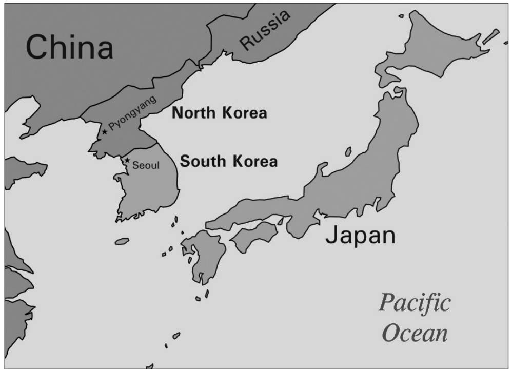
Located as it is near China and Russia, Korea serves as a foothold on the Asian continent to assert U.S. economic and strategic interests.

administrations is that they should not just focus on North Korea's nuclear weapons. In fact, all surrounding countries around the Korean peninsula have pursued military policies and strategies based on nuclear weapons as a deterrence, so you cannot just focus unilaterally on North Korea.