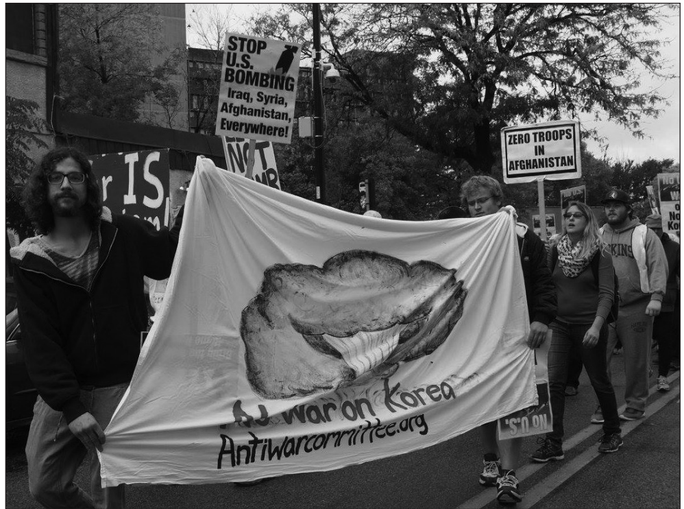
Protesting nuclear threat to Korea in a Minneapolis rally to end all wars.

All of the activists mentioned the 2018 Olympics to be hosted by