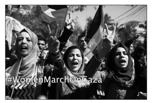
Palestinian Women were in the lead in Gaza for the six-week Great March to Return, which began March 30.

How the Israeli military attacked, maimed and killed peaceful protest-