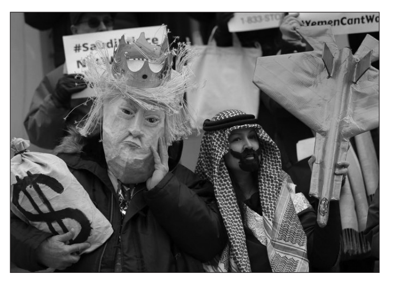
Protesters enact Trump and Crown Prince Mohammed bin Salman with a weapon, symbolizing the ones he was purchasing when he came to the U.S. in March.