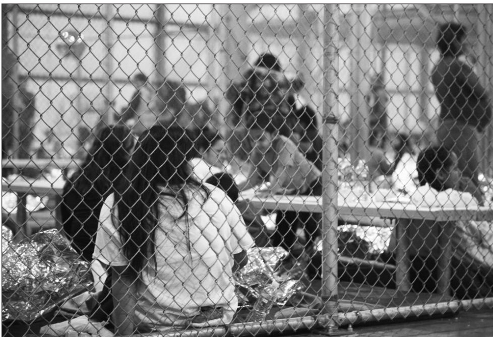
Immigrant children separated from parents and caged in detention centers.

Neuroplasticity is the brain's ability to rewire itself as a consequence of experience. Every time you learn something new, say, how to use your cell phone or how to speak Spanish, the physical structure of your brain changes. The brain is always plastic in a healthy person