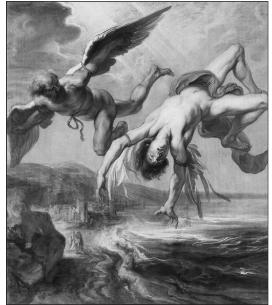
The Flight of Icarus. 17th cent. Flemish oil by Jacob Peter Gowry. Failing to heed his father’s warning about hubris, Icarus flew too close to the sun, causing the wax to melt that attached wings of feather to his body.

Since 1985 there have been attempts at the UN to expand the Outer Space Treaty of 1967 to prohibit not only nuclear weapons but all weapons from space. This is called the Prevention of an Arms Race in Outer Space (PAROS) treaty and leading in urging its passage have been Canada, Russia, and China. There has been virtually universal backing from nations around the world for it. But by balk-