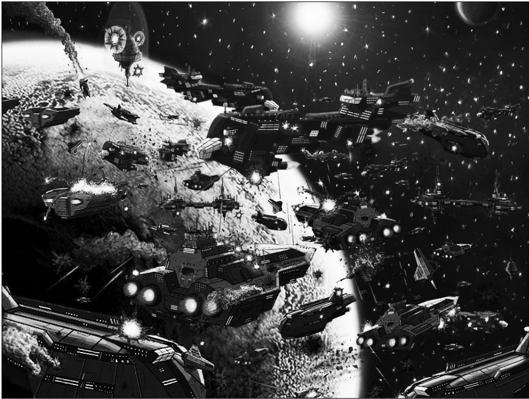
Space Battle by Villenummisalo. Deviantart.net

countries before they did this. And China's Foreign Ministry subsequently insisted, "There's no need to feel threatened about this," and pointed out that China had long pressed for an expansion of the Outer Space Treaty to prohibit not just weapons of mass destruction but all weapons from space – something the U.S., alone among nations, had and has long opposed.