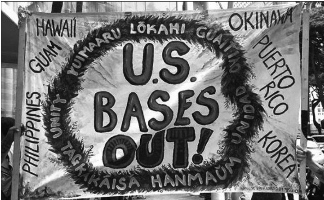
What's the North Atlantic Treaty Organization doing in the Pacific Ocean?

leaders, the bases not only aren't closed but continue to expand and be updated.