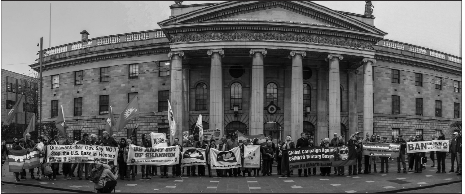
Bannering in front of the General Post Office, Dublin, November 16, 2018

A publication of Women Against Military Madness