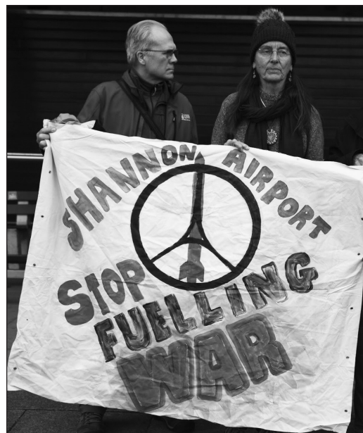
Shannon Airport has been used as a transit point for U.S. soldiers, weapons and extraordinary renditions.

At the GPO, a traditional place of protest in Ireland, the contemporary resisters held a demonstration and bannering, asserting the need for getting rid of U.S./NATO military bases. The leaders of the 1916 Rising had taken over the GPO, making it the working headquarters of their rebellion: It