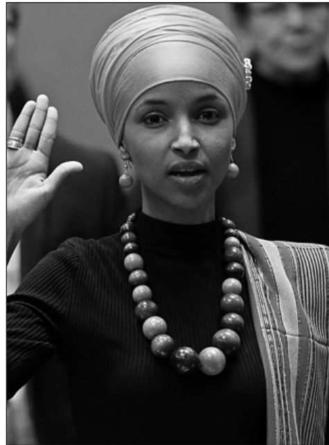
Ilhan Omar is sworn in as a congresswoman from Minnesota