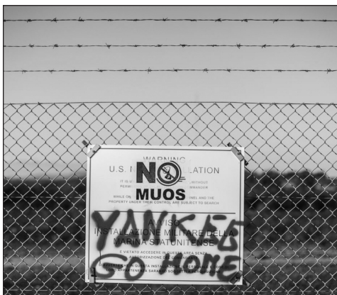
Sign on a local resident’s fence in Niscemi, Sicily. Alarmed about effects of high-frequency electromagnetic waves on human health and ecosystems, as well as complicity in warfighting, thousands attempted to block the installation of a U.S./NATO Naval Radio Transmitter system.

Base Nation: How U.S. Military Bases Abroad Harm America and the World , a book by David Vine (Skyhorse Publishing/Metropolitan Books, 2017)