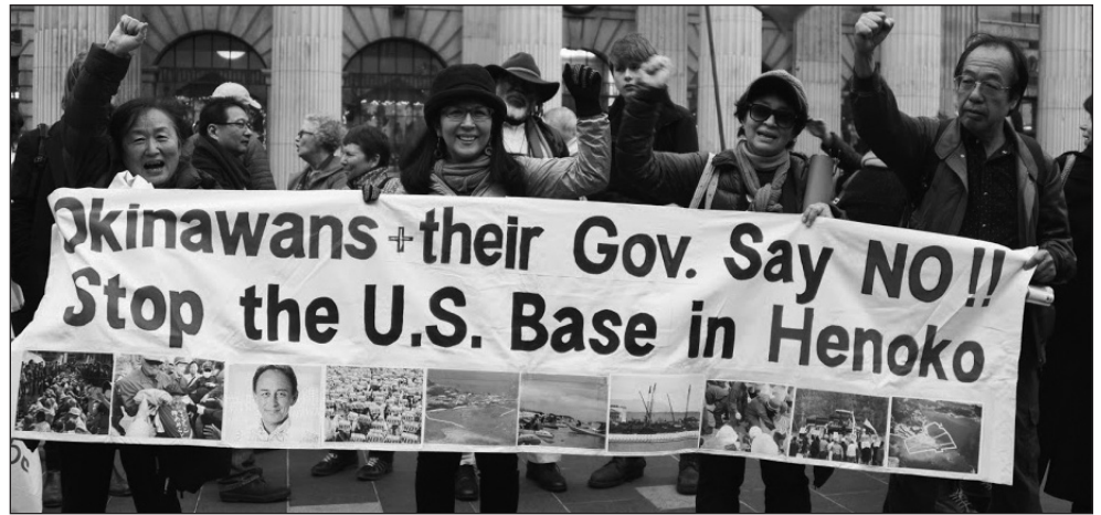
Okinawans protest during the Dublin conference. Resistance is fierce as U.S. bases consume 70 percent of their island and continue to expand.

Who knew that Italy had 10 percent of these bases – some secret, but many active in war? The extent, size, and importance of the U.S./NATO bases in Italy surprised many. U.S./NATO wars, including the wars against Yugoslavia, Libya, Afghanistan, and countries in the Middle East, have been waged from Italian bases. Two bases hold over 60 nuclear weapons in defiance of Italian law. One base holds the biggest arsenal outside the U.S. Another commands U.S. naval forces for Africa