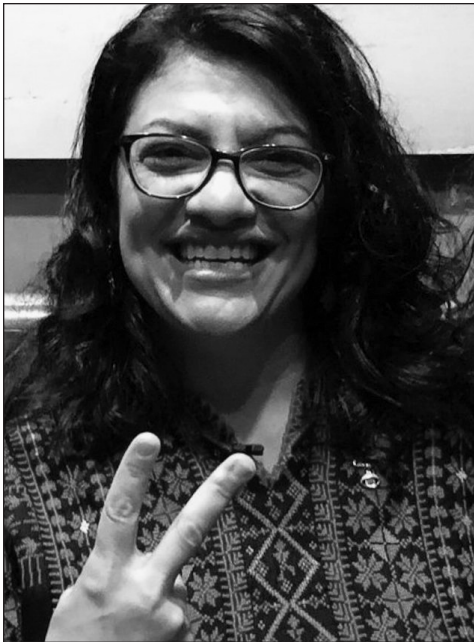
Rashida Tlaib at her swearing-in ceremony.