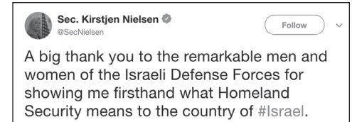
Screenshot: DHS Sec. Nielsen, tweet, June 2018

U.S. Homeland Security Secretary Kirstjen Nielsen appears not only to have enthusiastically been embracing exchanges with Israel about militarized border security, but to have been absorbing lessons during a visit last June.