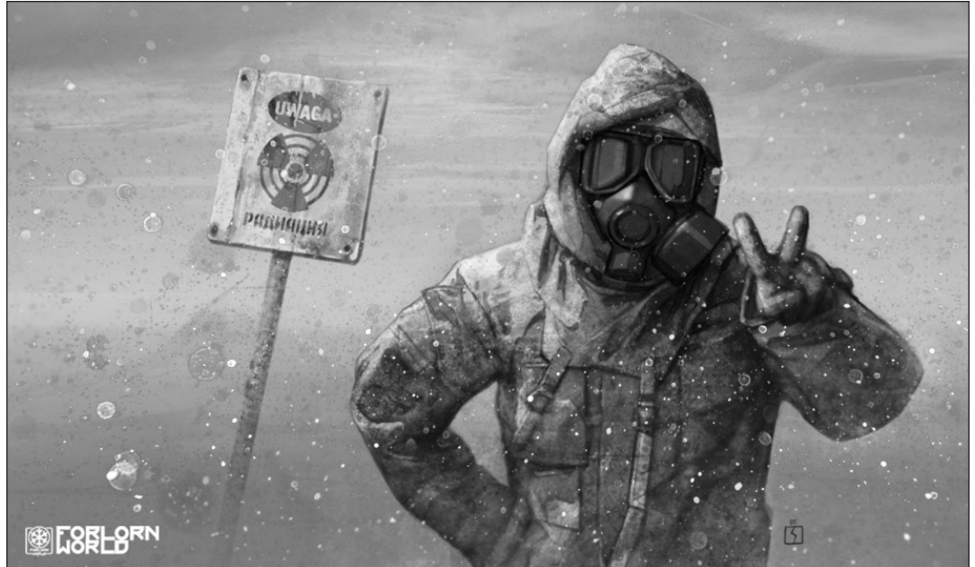
If used, even a few H-bombs could trigger cataclysmic climate disruption, causing crop failure and massive famine on the planet. Image: video game, "Nuclear Winter"