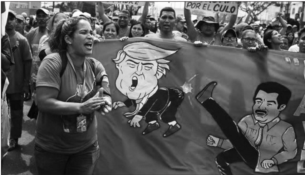
Kicking the U.S. out. Banner from large pro-Bolivarian march.

building which is beginning to raise rabbits. All the residents we spoke to are proud of their barrio and accomplishments and have a deep commitment to the Bolivarian Revolution ideals. Catia is pro-government and pro-Maduro.