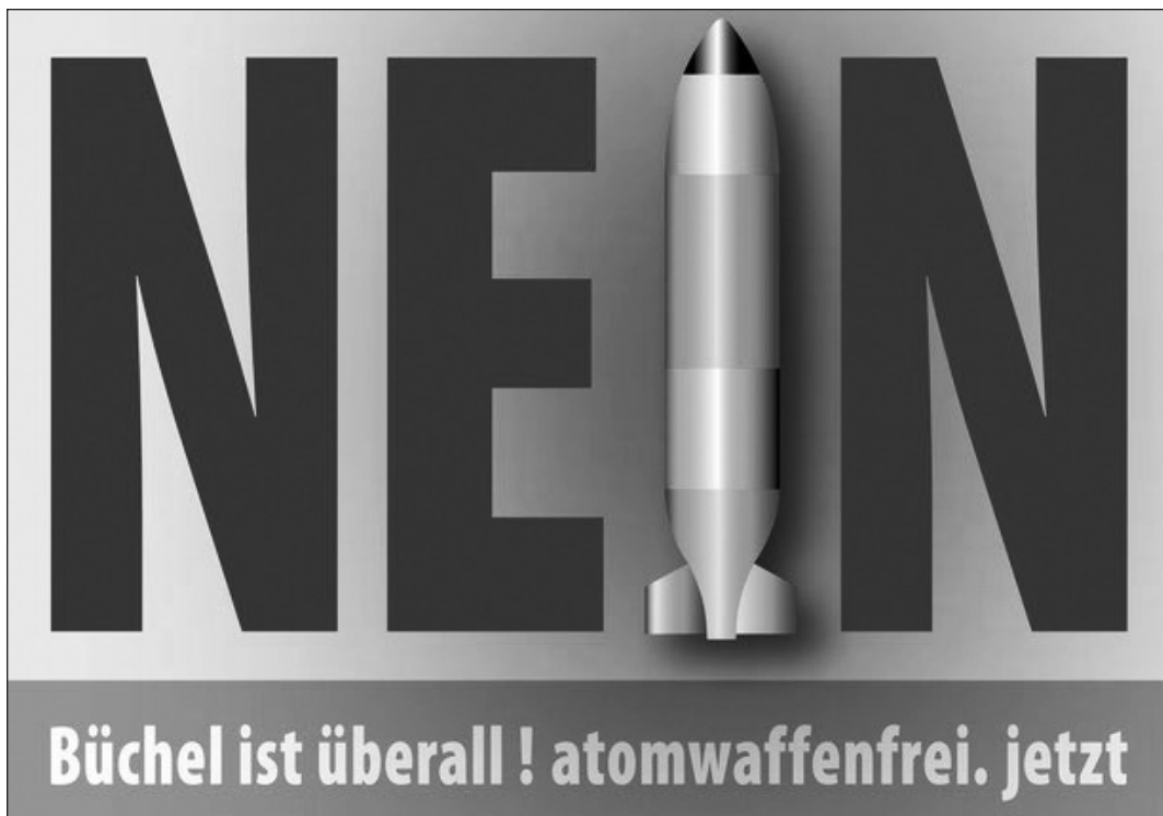
A nuclear-weapons free campaign logo proclaims, “Büchel is everywhere!”

damage that nuclear weapons would actually cause. As a result, any U.S. decision to use nuclear weapons almost certainly would be predicated on insufficient and misleading information. If nuclear weapons were used, the physical, social, and political effects could be far more destructive than anticipated.”