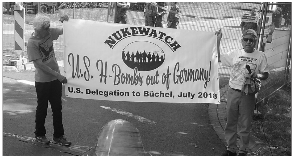
Nukewatch members are among activists from throughout the world who gather at Büchel Air Base to protest U.S. nuclear weapons and call for their elimination in Europe.

Within Germany there is a strong nationwide campaign called “Büchel Is Everywhere – Nuclear Weapons-free Now!” which is comprised of 60 groups and organizations that are focused on nuclear abolition. Aside from conducting lobbying work, “Büchel Is Everywhere” engages in nonviolent direct action which increases awareness and political pressure, keeps the B61 issue in the public eye, and challenges the