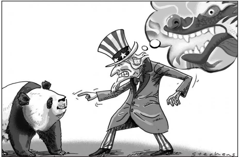
The U.S. is mocked for an exaggerated fear of China while it pokes the bear.

Those hard-liners agitating for war against China referred to themselves as “Panda Sluggers”. But the U.S. government also facilitated the U.S. business class, “Panda Huggers,” who wanted engagement with China. These two threads of U.S.-China policy have developed in the last several decades, sometimes at odds with one another, and sometimes complimenting one another.