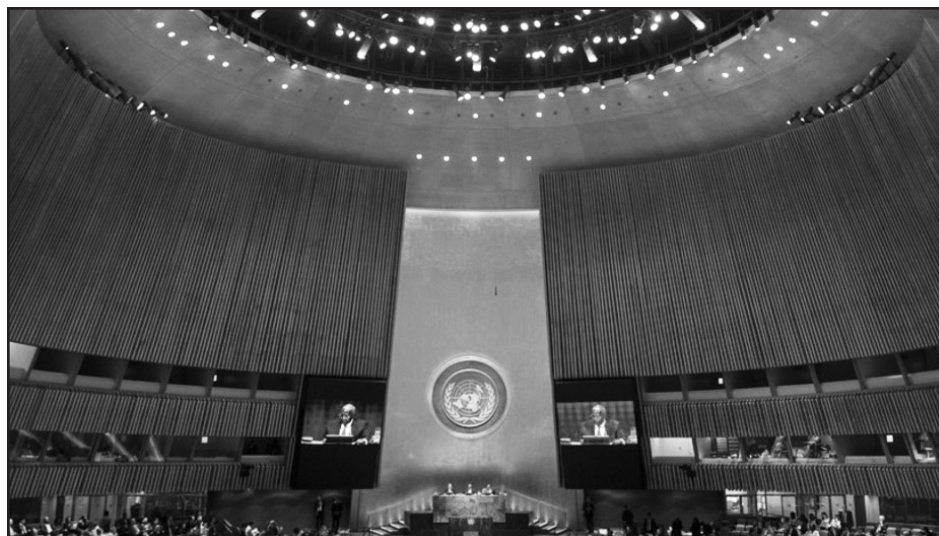
United Nations General Assembly Hall