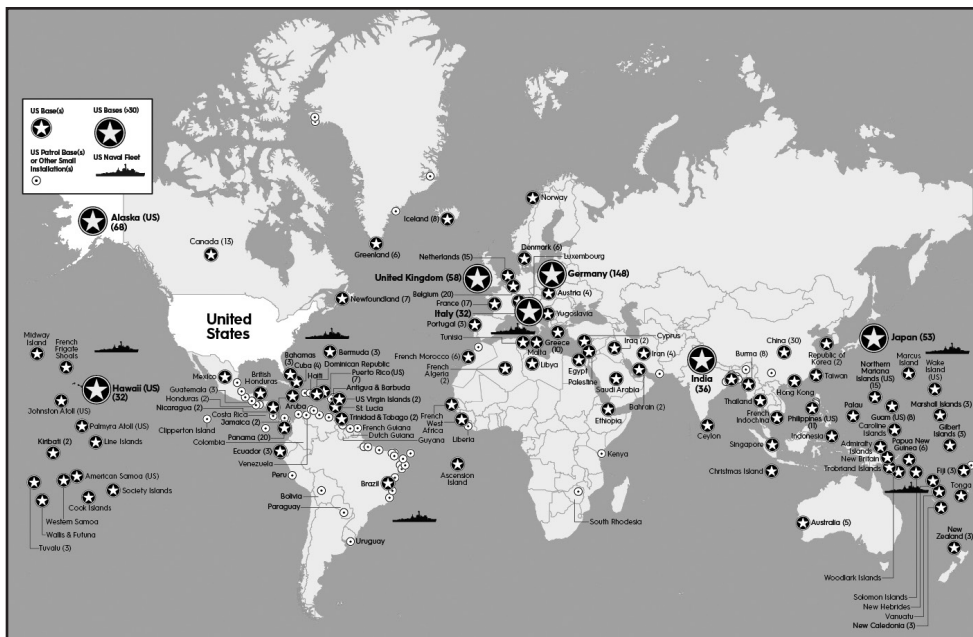
Stars represent U.S. military bases and installations. Map: basenation.us