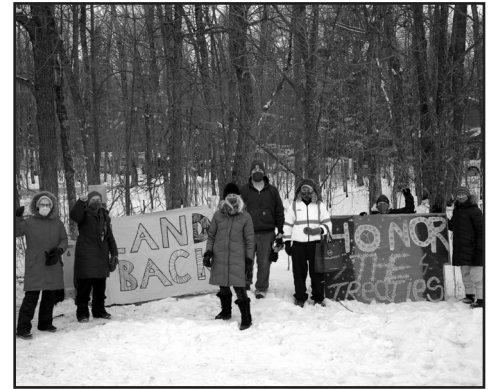
Women Against Military Madness visited a resistance encampment in northern MN.