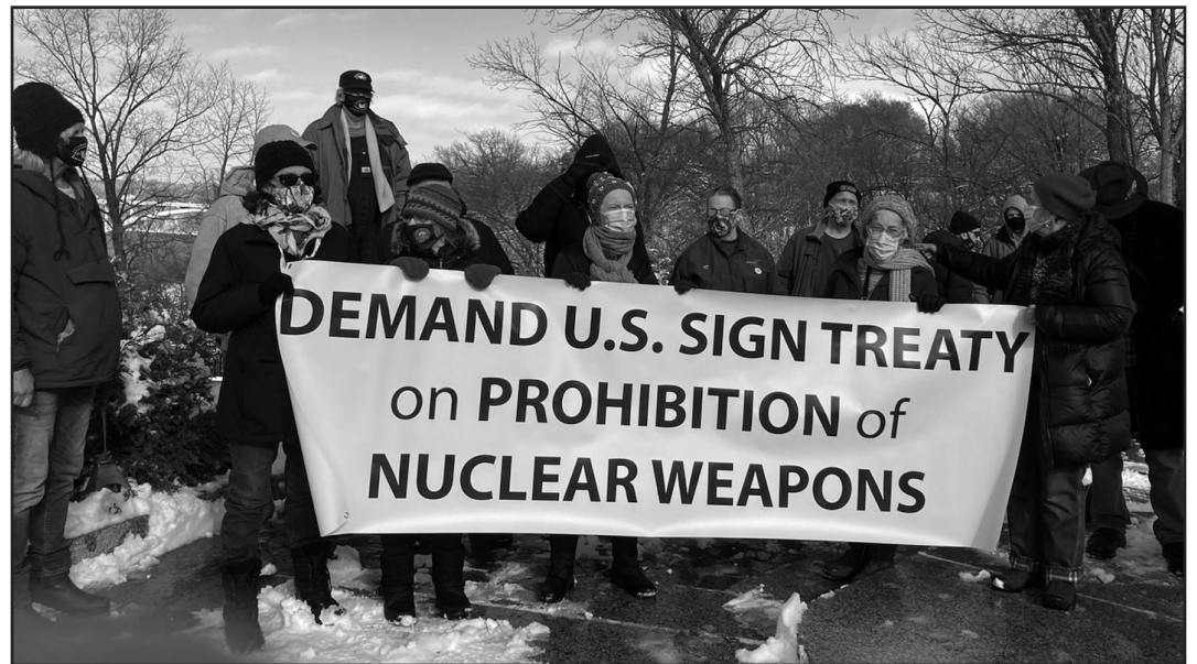
Minnesota peace activists, WAMM and VFP-27, demand the U.S. sign the treaty.