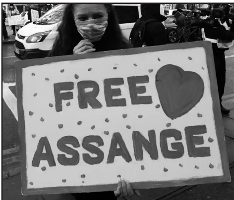
Sign held by a Julian Assange supporter.