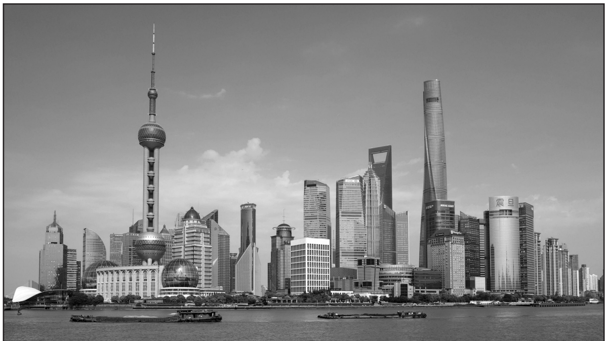
Shanghai, the financial center of China.