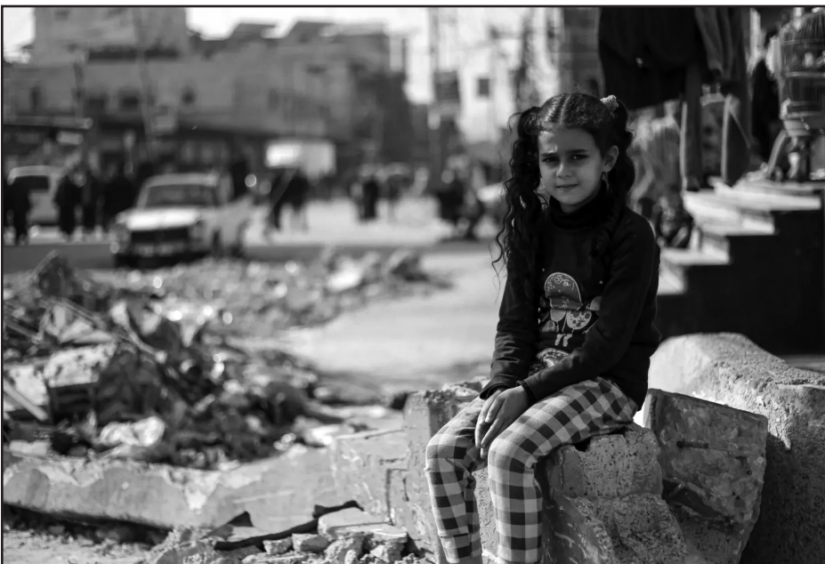
Not only are people dying of starvation, dehydration, disease, injury, sniper fire, drone and bomb attacks, but Gaza's natural and cultural environments are destroyed.

In another and very different part of Palestine, the genocidal bombardment of the densely-populated Gaza Strip caused 85% of the population to flee from the north to the south or be subject to further attack. 1.7 million Palestinian people were displaced – many of them forced to crowd together, eventually in Rafah (population 275,000) near the Egyptian border. Weakened from exhaustion,