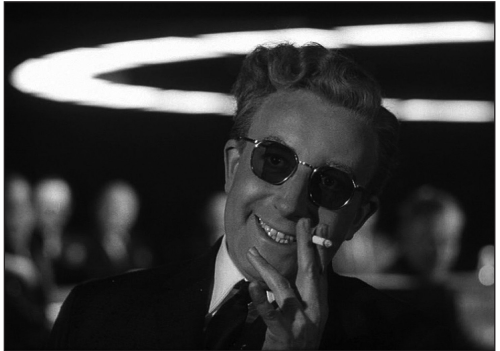
Dr. Strangelove is still with us in a new generation of the masters of war. (Photo: Peter Sellers in Stanley Kubrick's 1964 Cold War film.)