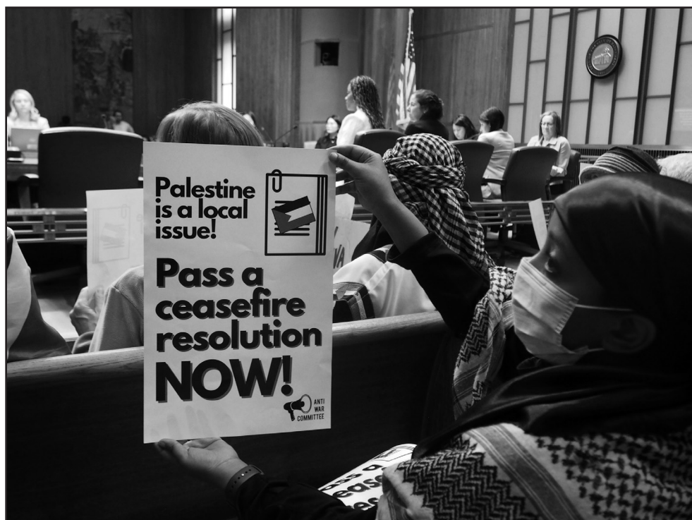
Inside St. Paul's City Council Chambers, people say it's a local issue; demand that the council pass a resolution to end genocide.