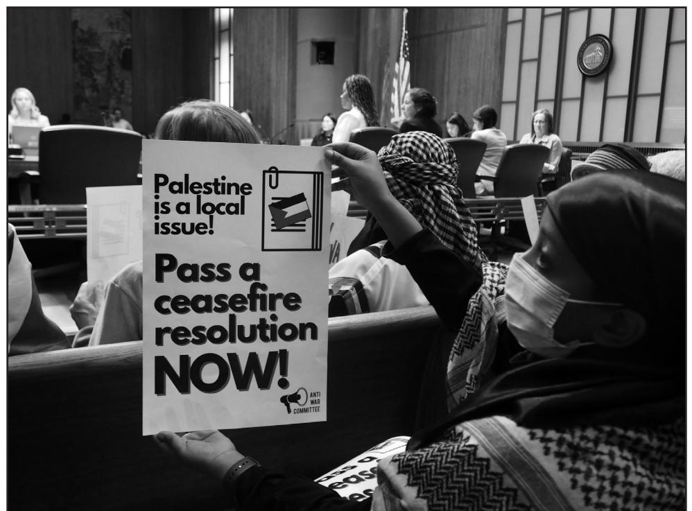
Inside St. Paul's City Council Chambers, people say it's a local issue; demand that the council pass a resolution to end genocide.