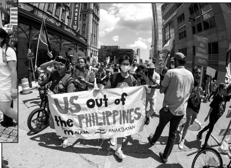
Resistance in Milwaukee to U.S. military in the Philippines for domination of the Pacific