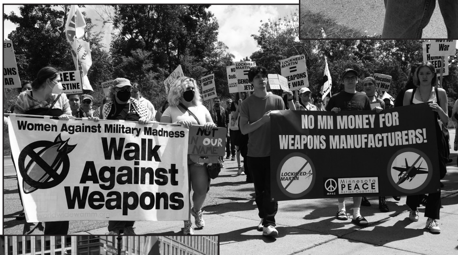
WAMM's Walk Against the Weapons of War