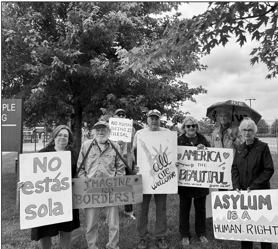
Welcoming signs at the weekly Immigration Rights Vigil, ICE facility, Ft. Snelling.