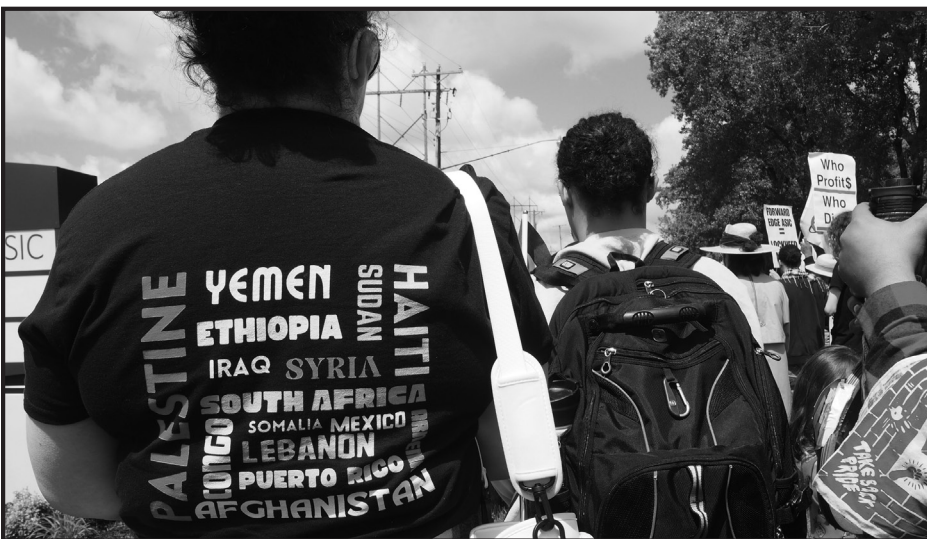
Protester’s T-shirt calls out countries in which there was U.S. intervention.