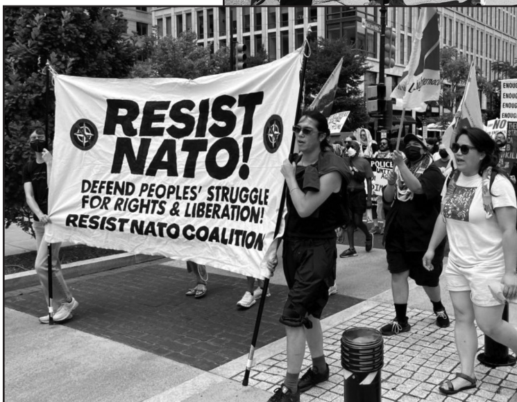
Protesting the military aggression of the U.S./ North Atlantic Treaty Organization (NATO).