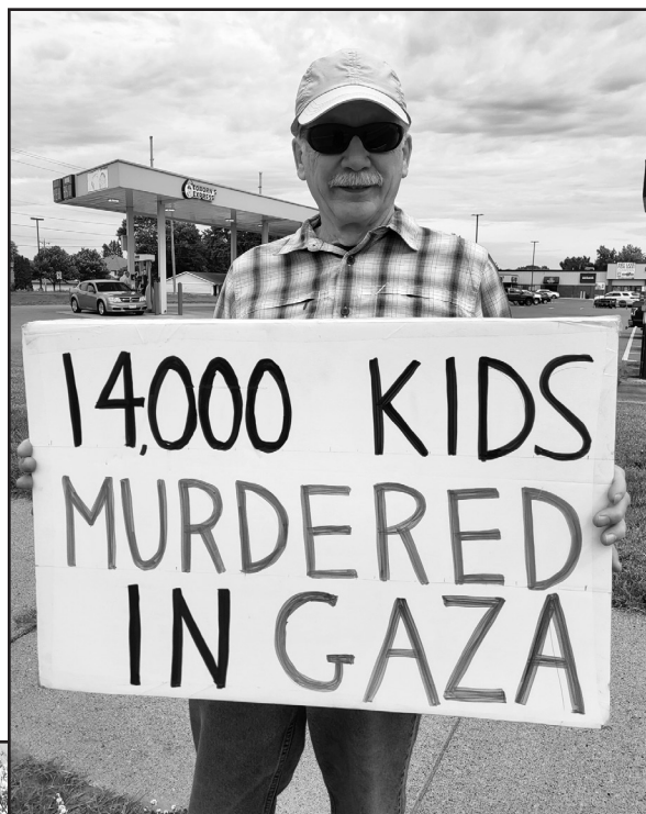
Protesting in Brainerd, Minnesota against the genocide in Gaza