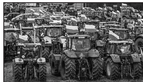
At the border, Polish tractors block cheap grain from Ukraine.