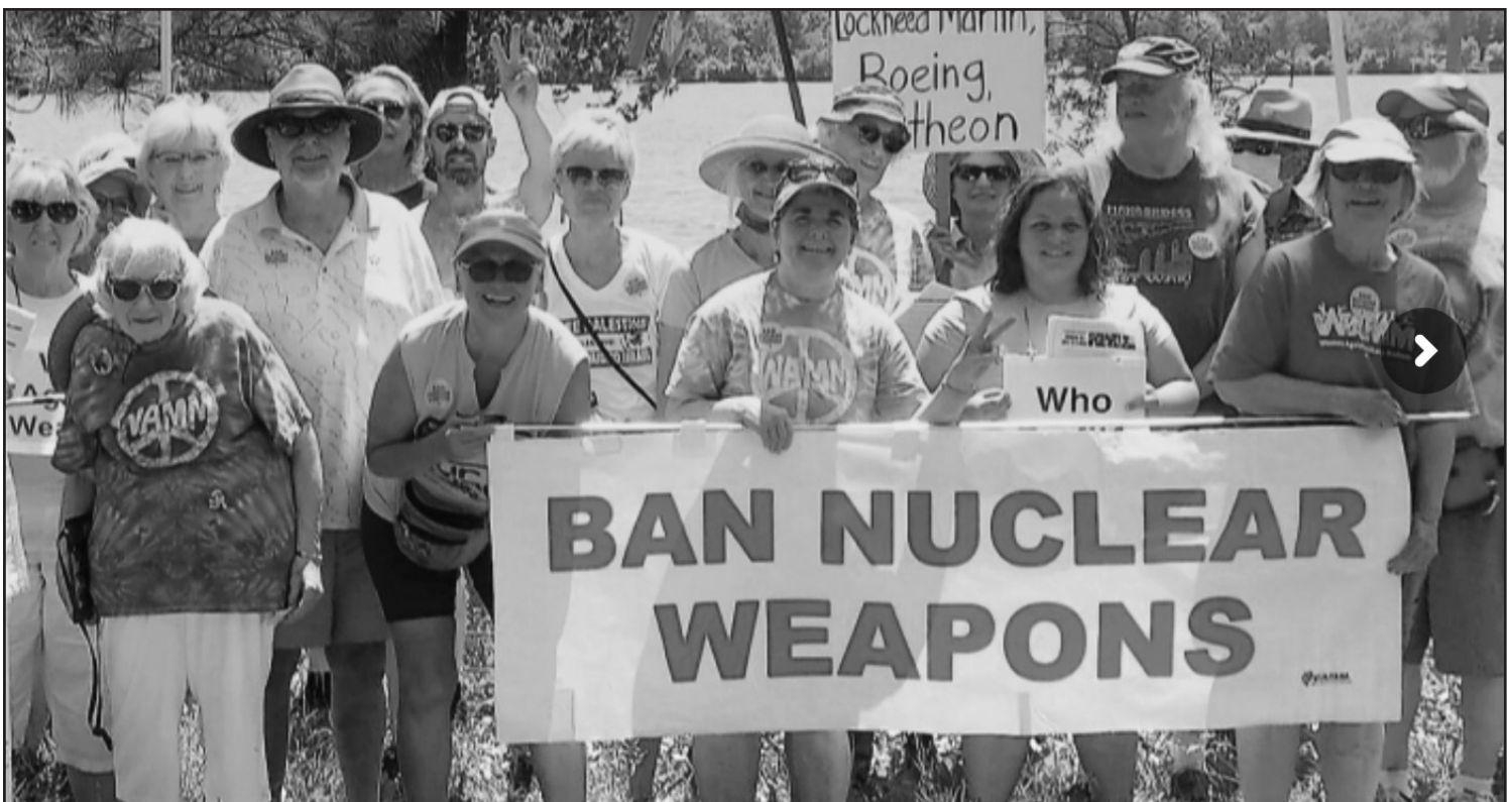
With the danger of nuclear war greater than ever and the Doomsday Clock ticking toward omnicidal midnight, Women Against Military Madness proclaims the need to ban nuclear weapons.