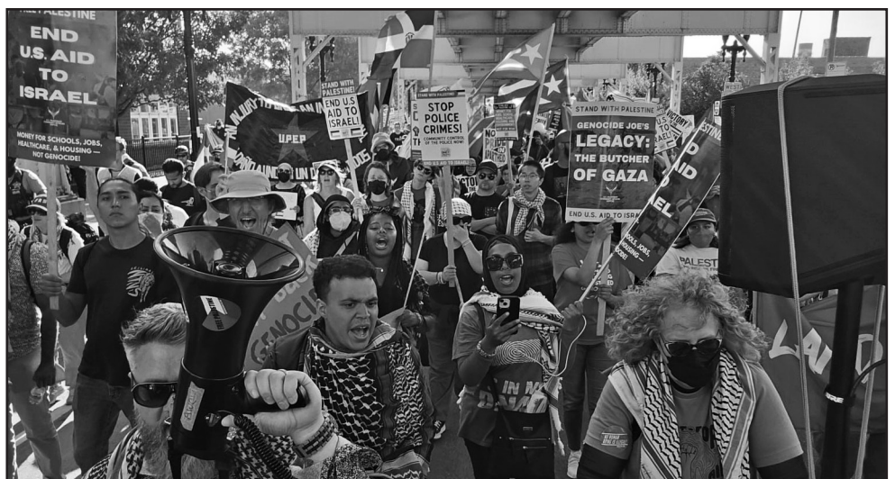
Impassioned demonstrators filling the streets of Chicago outside the 2024 DNC, chanting loudly so that their demands could be heard inside.

On the last day, while Kamala Harris was giving her presidential nominee acceptance speech inside, more than 11,000 people marched for Palestine. The protesters outside in the streets chanted against the U.S.-backed genocide in Gaza and delegates inside the convention center reported hearing them. Despite pressure from police – hundreds of them clad in riot gear – demonstrators remained in the