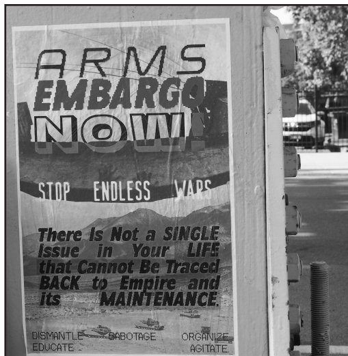
Poster affixed to an artist easel on a Chicago street during the DNC demanding an arms embargo.