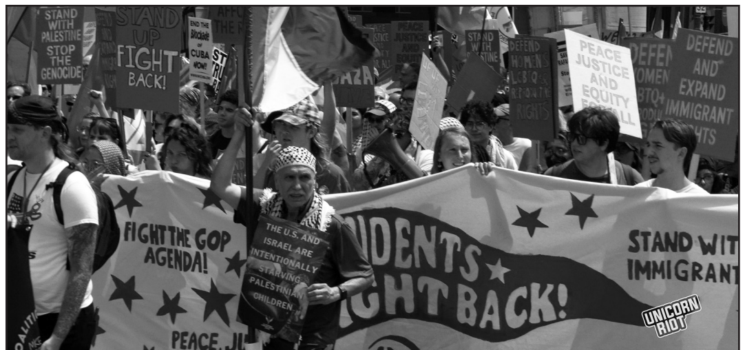
People filled the streets outside the 2024 RNC calling those inside to represent their demands.