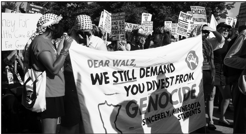
Minnesota students called for Vice President nominee Governor Tim Walz, to divest from the state's financial investment in Israel.