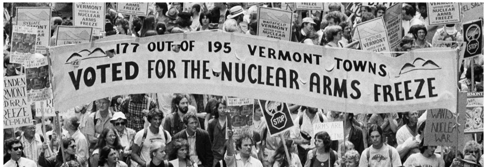
Over one million participated in a nuclear disarmament demonstration. New York City, June 12, 1982

A Treaty on the Prohibition of Nuclear Weapons – banning all nuclear weapons – has been signed and/or ratified by the great majority of nations on Earth. Early this year, the tally was ratified