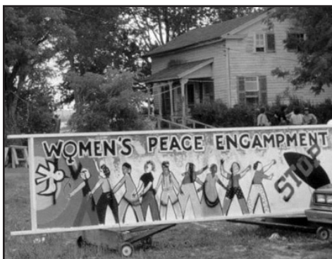
Women's encampment protests the nuclear stockpile. Seneca Falls, 1983

Raise awareness of the danger of nuclear war by distributing WAMM's Nuclear Winter cards. Leave stacks at libraries, community centers, friendly shops, cafes and bakeries, places of worship, etc. Pass them out to friends and family. See opposite page for more info.