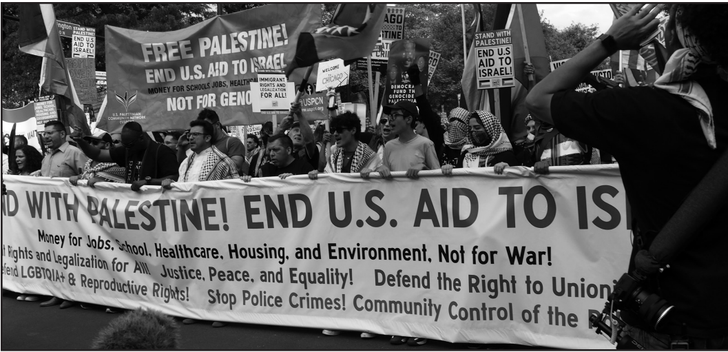
The banner that led off the 2024 March on the DNC. United under ending U.S. genocide in Palestine, diverse groups called for supporting human needs instead.